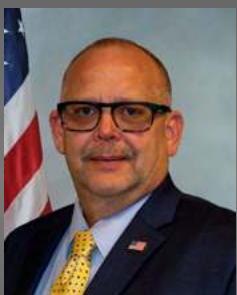
Lt. Rider Detective Bureau